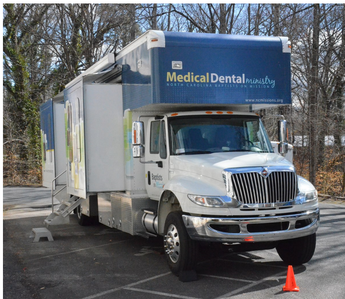
First UMC partnered with Grace Clinic and the NC Baptist Dental Ministry to host a free dental clinic at our church on March 3. The "dental truck" features two fully functioning rooms to take care of dental needs of Grace Clinic patients. This is just another example of our outreach to those in need within our community.

Details of all the Holy Week services and activities will be shared in the next issue of The First Word .